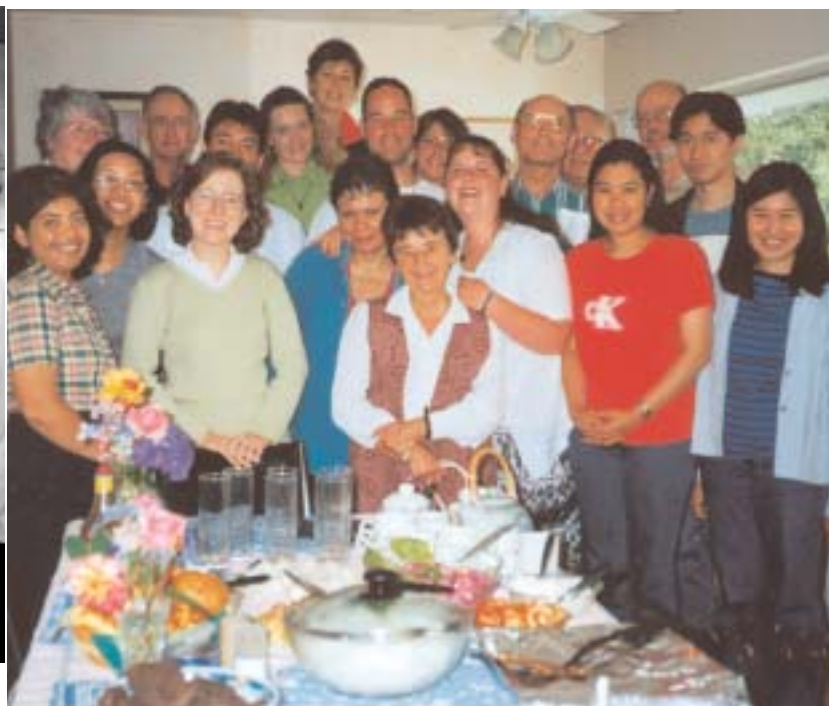
Left: All ready for mass... Right: Volunteers training meeting lunch with Hope-Faith House Residents!